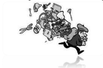
Fig.: Theft of Assets*